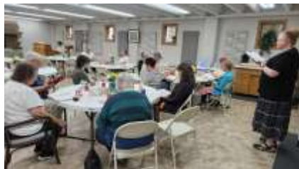
Volunteer Appreciation Luncheon June 11